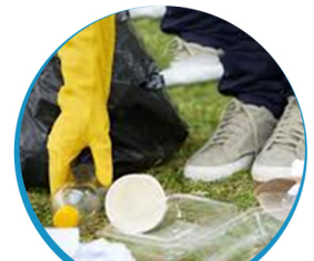
Community Litter Picking

We would love to do more and with your help, we can